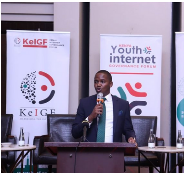
Senator Allan Chesang, Chairperson, ICT Committee, Senate

The Senate ICT Chairperson indicated that it was an honor to be invited to this Ideal platform for discussing policy issues regarding ICT governance. The policies include robustness, security, sustainability, and development. "The event serves as an interactive session to discuss the ideas and different scopes facing the Internet governance ecosystem". The turnout is a testament to the youth being engaged in the internet and governance. Tech is evolving for instance there are new conversations coming up such as AI and content creation which are emerging topics for the youth and which they need to be engaged in. "Our role as the government in this has been seen by the development of the data protection act which regulates the processing of personal data and protecting the rights of data subjects."